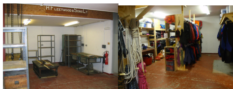
The store before The store after!

Since the last newsletter, Outfit has moved bases from Elgin to Lossiemouth, which has given us much more space and far better security for our minibus and bike trailer. Our new building was formerly Fleetwood's engineering workshop on Shore Street, and the 280 square metres of space means that we now have our office, equipment store, drying room, meeting room and van storage all under one roof.